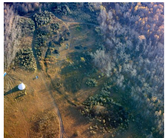
Aerial photograph by Harrison Boss.